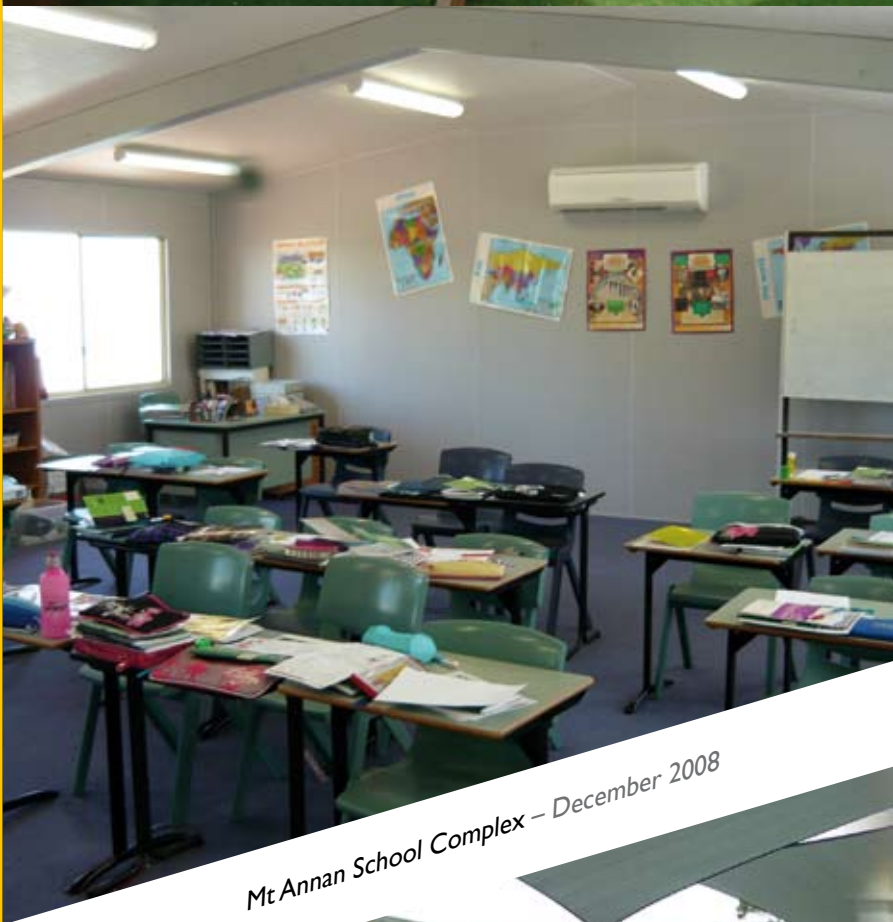
Mt Annan School Complex – December 2008